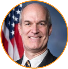
Congressman Rick Larsen (WA-2)

House Committee on Transportation and Infrastructure; Chair, Subcommittee on Aviation