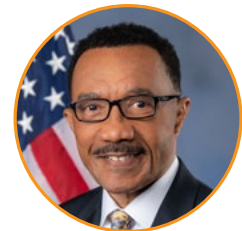
Congressman Kweisi Mfume (MD-7)

At-Large Director, AMAC Board of Directors; Vice Chair, AMAC Government Affairs Committee