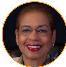
Congresswoman Eleanor Holmes Norton (D-DC)

Deputy Chief Revenue Officer, Philadelphia International Airport