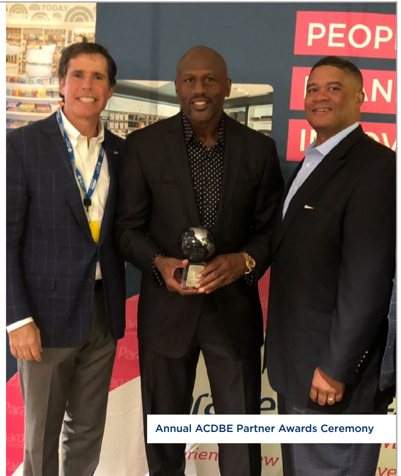
Annual ACDBE Partner Awards Ceremony