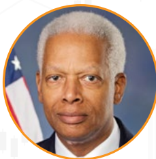
Congressman Hank Johnson (GA-4)

Local Chair, 2022 AMAC Airport Business Diversity Conference; Chief Administrative Officer / Managing Deputy Commissioner, Chicago Department of Aviation